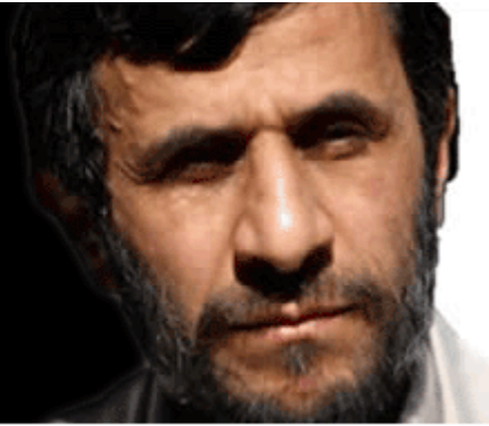
Iran's Radical President Ahmadinejad

America's energy supply depends on oil and gas imports from hostile foreign countries that harbor terrorism. Yet Congress still refuses to allow expanded American energy production, even though: